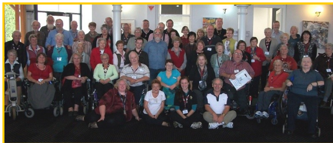
2011 Retreat Group, Mt Eliza (above) / Keeping the Mind Active (below)