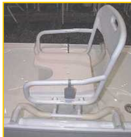
Swan Bath Seat