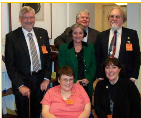
Delegation with Senator Claire Moore

Polio Australia is grateful for the support provided by our Parliamentary Patrons: Mark Coulton, Jill Hall, Greg Hunt, and Catherine King; as well as the growing number of Parliamentary Friends of Polio Survivors.