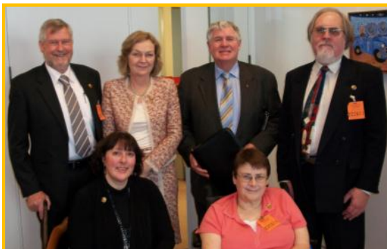
Delegation with Senator Jan McLucas

Polio Australia also hosted a Parliamentary Patrons and Friends Luncheon with: