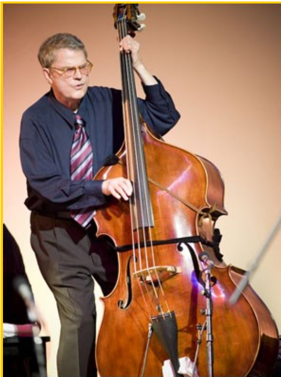
Charlie Haden